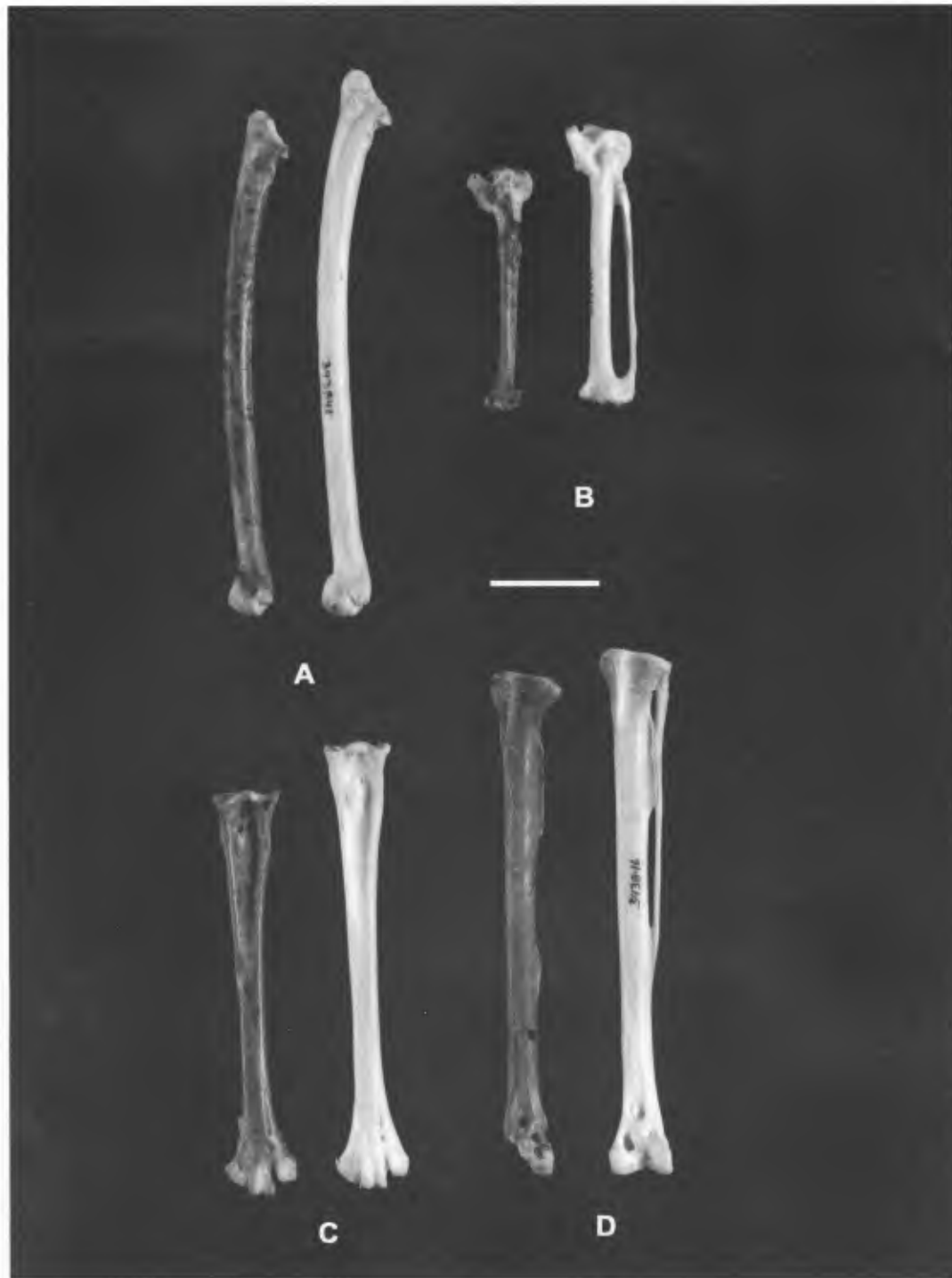
Fig. 3. Limb elements of Caracara creightoni (on the left in each pair) compared with C. cheriway (on the right in each pair). A, left ulnae in internal view (MPSG 75, USNM 343846); B, right carpometacarpi in internal view (MPSG 77, USNM 343846); C, left tarsometatarsi in anterior view (MPSG 103, USNM 343846); D, left tibiotarsi in anterior view (MPSG 103, USNM 343846). Scale = 2 cm.